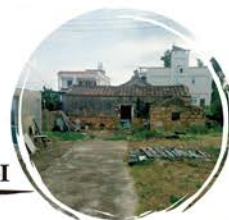
Former Residence of Tsai Fu-I