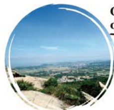
Overlooking the full view of Jinsha Township