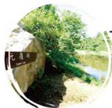
Yuan Lu Lake